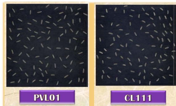
PVL01 has a longer grain than other long grain varieties and also has an excellent grain appearance.