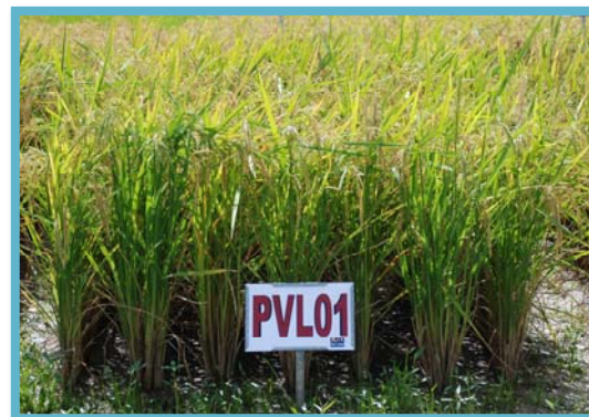
Yield testing plot of PVL01. PVL01 is the first released variety with resistance to Provisia herbicide. It is a semi dwarf, long grain variety.

In summary, the Provisia rice system will be an excellent tool for rice producers and will extend the life of the Clearfield technology. The first Provisia line, PVL01, appears to be a very good initial line that will be very well suited for producers with fields that have problems with Clearfield-resistant weedy rice. This line was developed very rapidly to enable producers to utilize this important technology as soon as possible. There are new Provisia experimental lines in the research pipeline. We are focused on increasing the yield and disease resistance while maintaining the grain quality that is found in PVL01.