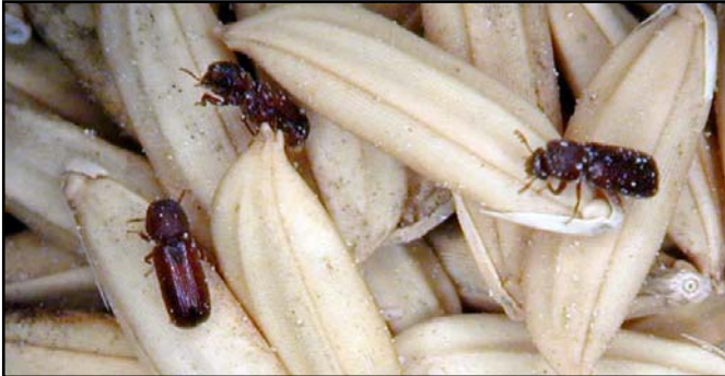
Lesser grain borer, Rhyzopertha dominica

Now that most of the rice is out of the field and temperatures are beginning to cool down, you may think your problems with insect pests are over for the year. However, stored grain pests remain a threat year-round. Even during winter months, grain bins can remain warm enough for insect pests to thrive if not properly aerated. From the time it is cut to the moment it is sealed in packaging, rice is vulnerable to attack from numerous stored grain pests. Management of stored grain pests is an important operation from small on-farm silos to commercial rice dryers and mills. Hundreds of different insects, including many types of beetles and moths, are known to infest stored rice around the world. The most commonly encountered pests infesting stored rice in Louisiana are the red flour beetle, the confused flour beetle, the lesser grain borer, the flat grain beetle and the rice weevil. All of these pests live and breed in stored grains, severely reducing grain quality of both rough and milled rice. As their names suggest, grain beetles are more prone to attack rough rice, while flour beetles are more common pests of milled rice.