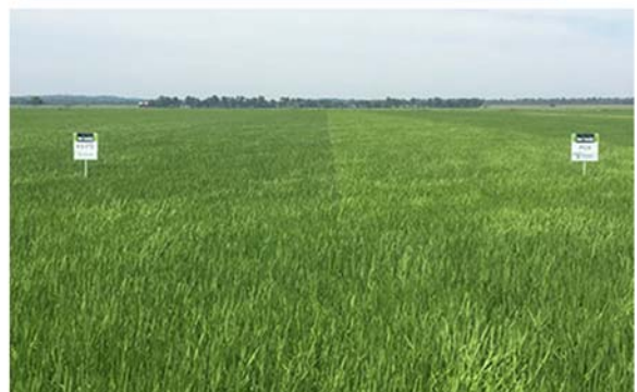
Figure 2. CL172 and PVL01 grown side by side illustrating the light green color associated with PVL01.

*Boxed yield designates estimated optimum yield across N rates.