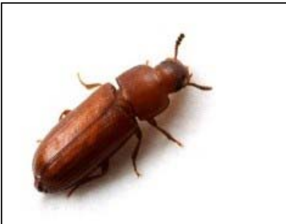
Confused flour beetle, Tribolium confusum

While proper sanitation and aeration can significantly reduce the need for chemical control, insecticides often are needed to suppress pest populations to acceptable levels. In the past, fumigation with methyl bromide was widely used across the U.S. to manage stored grain insects. This chemical is no longer registered, but alternatives are available. Fumigation with Phostoxin (phosphine) or Profume (sulfuryl fluoride) has now replaced the use of methyl bromide. These chemicals are highly toxic to humans and insects alike, and fumigation requires special training and equipment. Several fumigation services are available to provide these treatments on-site to rice mills and farm grain storage bins. The services often will assist in pest identification and recommend appropriate controls.