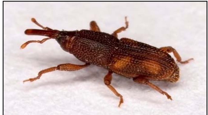
Rice weevil, Sitophilus oryzae

Management of stored grain pests is achieved with a combination of sanitation, aeration and chemical controls. Good sanitation and well-maintained equipment is the first line of defense against stored grain pests. Infestations often begin outside the grain bins in piles of spillage, and elimination of stray grain piles near