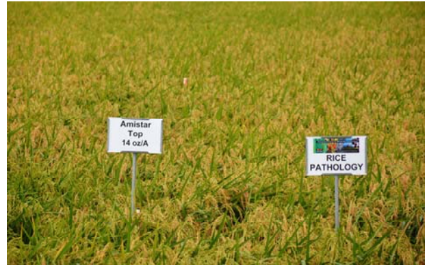
Amistar Top applied to fungicide resistant sheath blight

Once fungicide resistance develops to one type of fungicide, another will have to be used. If you have strobilurins resistance, which is most common, you have to use either a SDHI, such as Sercadis or Elegia, or the Triazole Amistar Top to control sheath blight. Limited data shows SDHI fungal resistance is developing in some fields where that fungicide class has been used extensively. Amistar Top can be used to control both strobilurin and SDHI resistant sheath blight fungi. If Amistar Top or any other fungicide is used exclusively season after season, resistance to that fungicide will likely develop. Let's be proactive rather than reactive in dealing with the rice pathogen fungicide resistance by rotating fungicides.