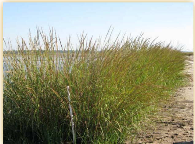
Advanced smooth cordgrass line at the Belle Chasse testing site