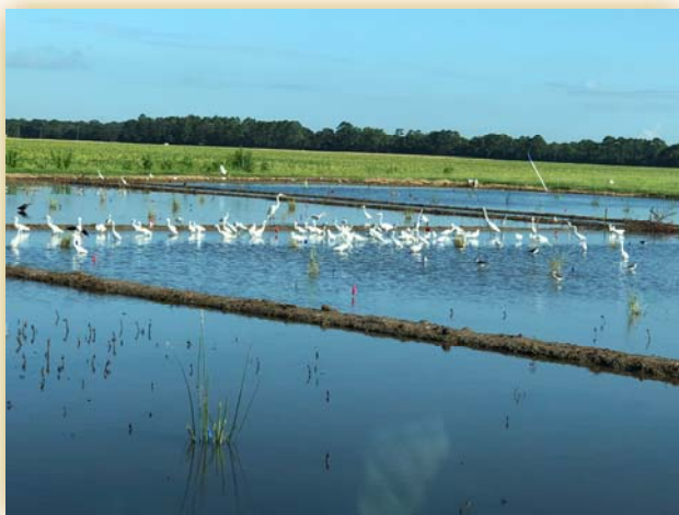
New plots of coastal plants at the Rice Research Station