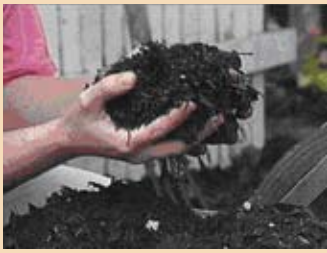
Figure 2. Fully composted manure.