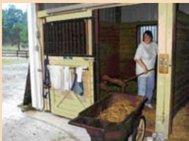
Figure 1. Stall cleaning

Horse manure mixed with sawdust (Figure 1) or woodchips is a totally different story. When these mixtures are spread on farm fields, they often stunt crop growth. Since farmers do not want to stunt their crops, horse owners using these bedding products are left with few good options for disposing of the manure.